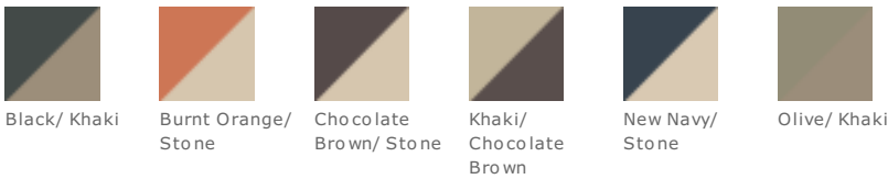
Black/ Khaki Burnt Orange/ Stone Chocolate Brown/ Stone Khaki/ Chocolate Brown New Navy/ Stone Olive/ Khaki